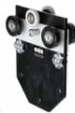
Multi-Purpose Carrier 6" wide x 8-1/4" high 1 - 4 lbs.