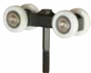
No. 1751A 4-1/2" long x 3-1/2" high 3/8" thread, 14.5 oz. (Cannot be used with curved track sections)