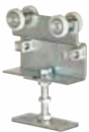
No. 1751-N 1-1 lb. 4 oz. 4-1/4" long x 1-1/2" wide x 4-1/2" high (max.) (to base of plate)

SLIDING DOOR CARRIERS are composed of 4 steel or nylon-tired ball-bearing wheels. The carrier rolls along the track and can support loads up to 150 lbs. depending on model. Its adjustable design permits leveling of door or panel height.