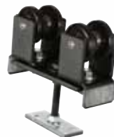
No. 5051 Scenery Panel Carrier 5-1/16" long x 2-3/16" wide 1 - 2 lbs. 6 oz.